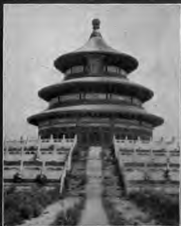
BLUE DOME, IN TEMPLE OF HEAVEN, PEKING